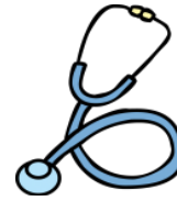
This Photo by Unknown Author is