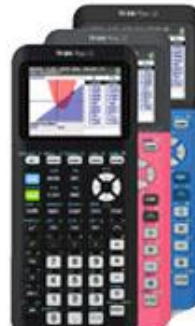
TI-84 Plus CE

NO SHARING OF CALCULATORS WILL BE ALLOWED, EVEN IF YOU ARE DONE WITH THE TEST.