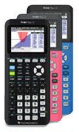
TI-84 Plus CE