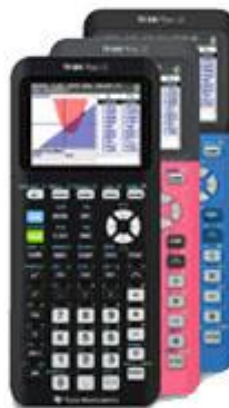
TI-84 Plus CE

NO SHARING OF CALCULATORS WILL BE ALLOWED, EVEN IF YOU ARE DONE WITH THE TEST.