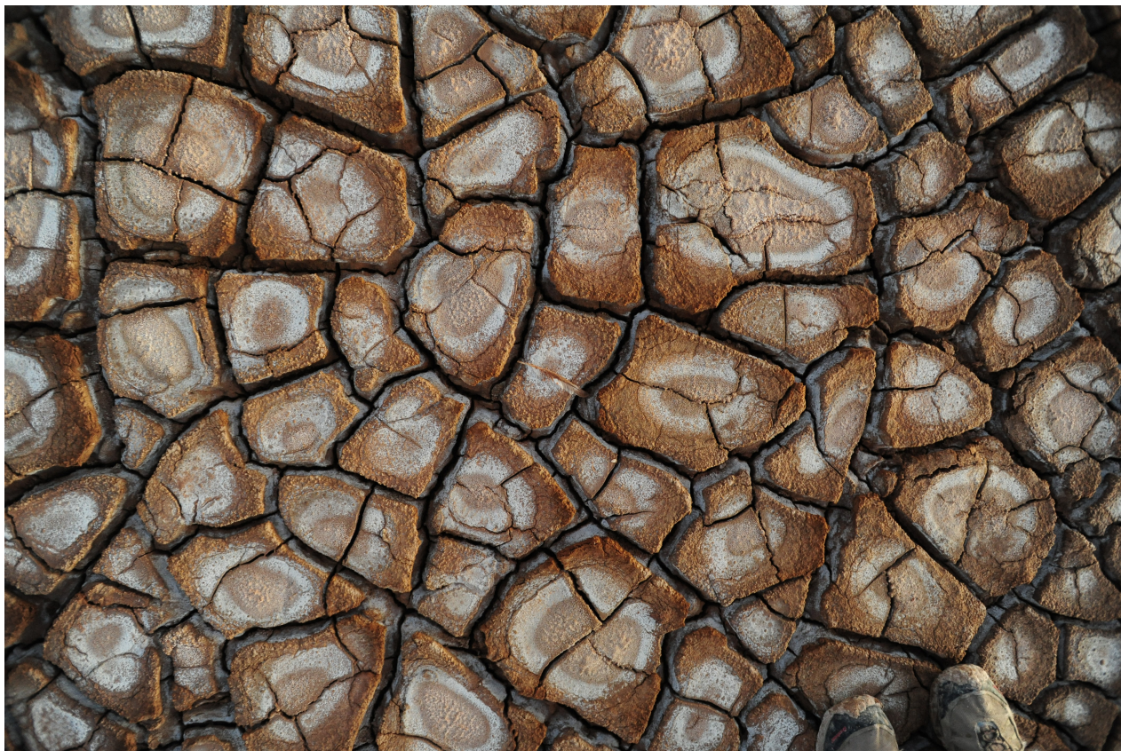
"Mudcracks at the Salton Sea" (2016)

Geology 100: Physical (or General) Geology