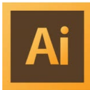
Illustrator Logo 1

A personal copy of Illustrator CC will be needed. You can download the 7 day free trial to get started. Eventually you'll need to lease or buy Illustrator CC. You can lease Illustrator CC for $19.99 per month on www.adobe.com on the Students and Teacher plan. This option comes with the entire Adobe Suite and includes Illustrator.