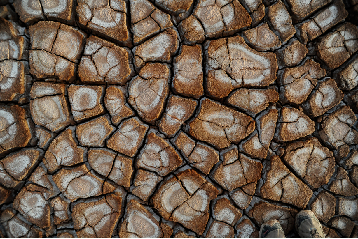
"Mudcracks at the Salton Sea" (2016)

Geology 100: Physical (or General) Geology