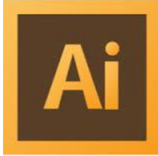
Illustrator Logo 1