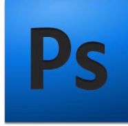
Photoshop Logo 1